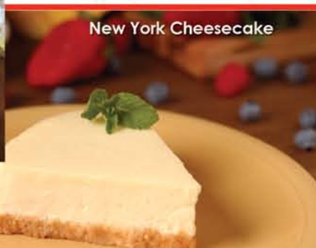
New York Cheesecake