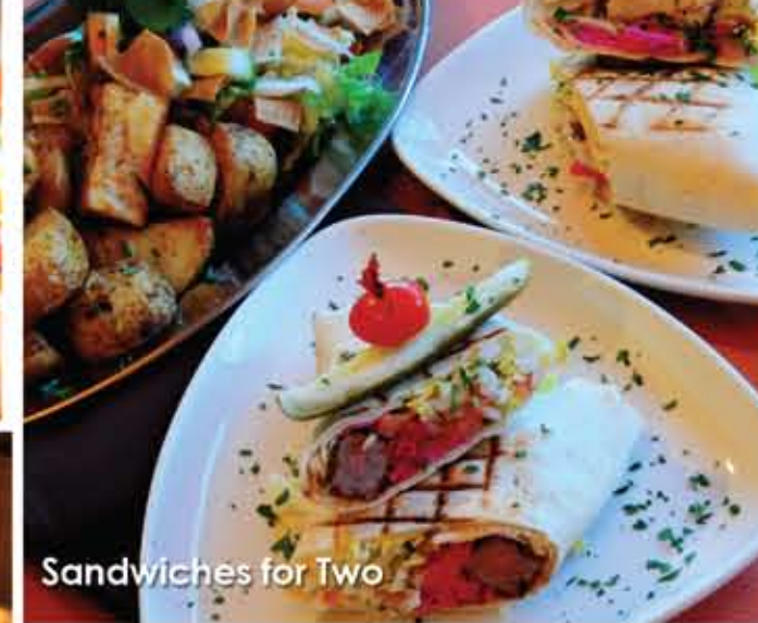
Sandwiches for Two