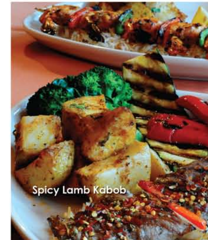
Spicy Lamb Kabob