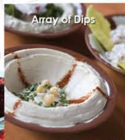
Array of Dips